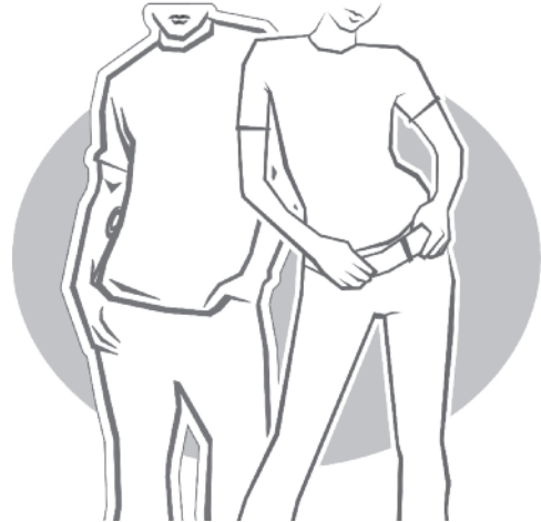
Clothes in the latest style