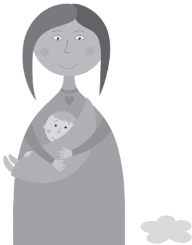
Protection from abuse and neglect