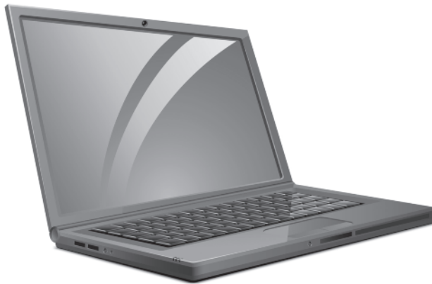
A personal computer