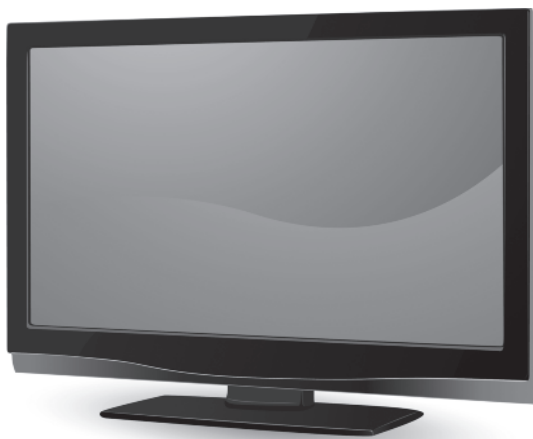
A television set