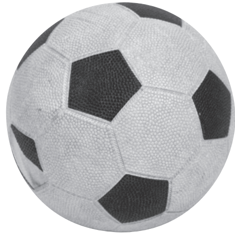
Playgrounds and recreation