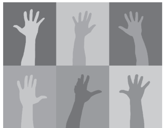
Opportunities to practise your own culture, language and religion