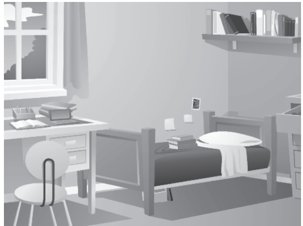
Your own bedroom