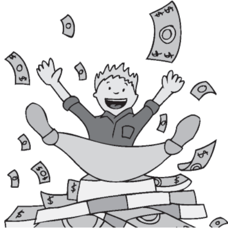
Money to spend as you like