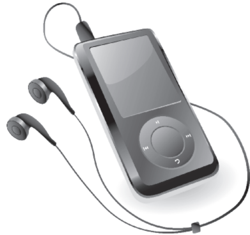
A personal stereo