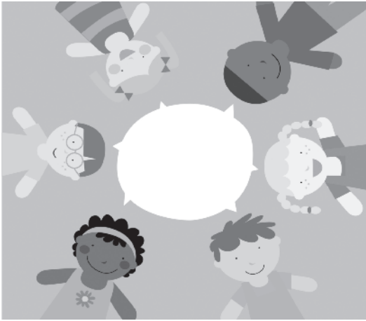
Opportunities to share opinions